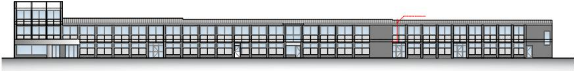
FRONT ELEVATION (BLDG. A)