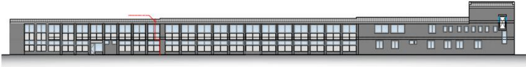
REAR ELEVATION (BLDG. A)